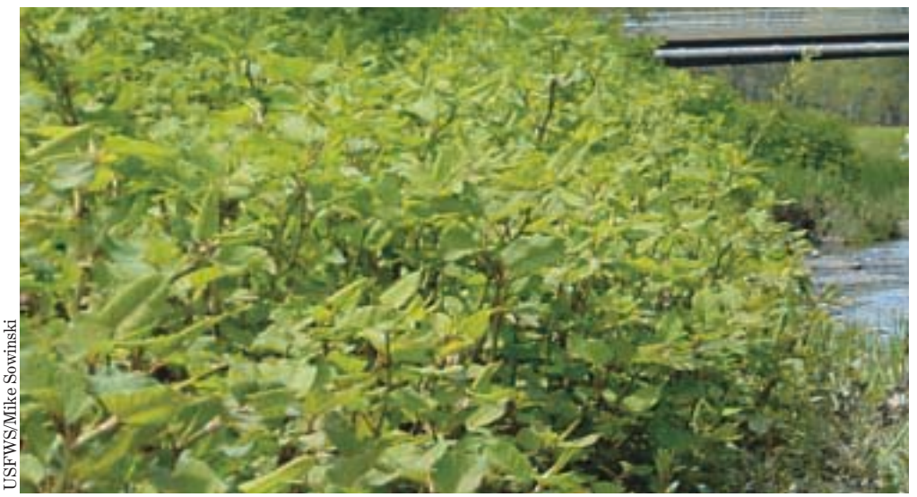
Japanese knotweed (Polygonum cuspidatum) was introduced into N. America as an ornamental hedge and is now common along creeks.

Such easy access emphasizes the need to educate consumers about the harmful effects of invasive species as well as state and federal laws prohibiting the possession of certain species.