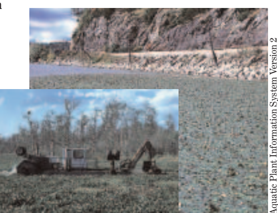
Water chestnuts (Trapa natans) are controlled by mechanical harvesting in many lakes.

U.S. Department of Agriculture http://plants.usda.gov